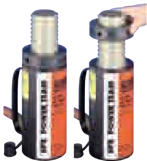
Locking collar feature permits non-hydraulic support of load.